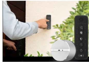
smartlock.jpg (1006x654) (verisure.de)